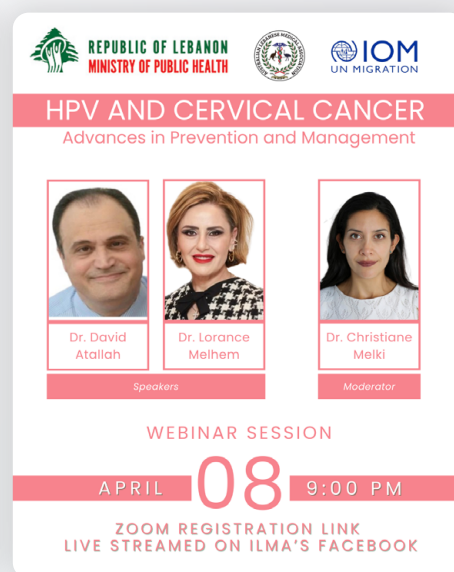
Figure 2. Quarter I Webinar Series Poster Collection