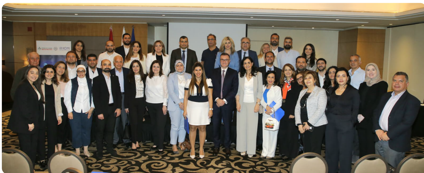
Figure 3. Stakeholders Gather at the Food Supplements Regulation Workshop in Lebanon

A full-day workshop titled Regulating Food Supplements in Lebanon: Global Perspectives, Local Action was held on April 22, 2025, at the Mövenpick Hotel, Beirut, Lebanon. This first-of-its-kind event gathered stakeholders from government, industry, academia, and international organizations to discuss national regulatory reform. The workshop featured a presentation on Australia's regulatory model, followed by a panel discussion that addressed challenges, opportunities, and context-specific strategies for improving food supplement regulation in Lebanon. You can visit MoPH's LinkedIn and website to read more about the event.